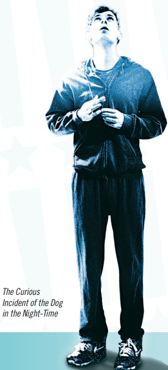
The Curious Incident of the Dog in the Night-Time