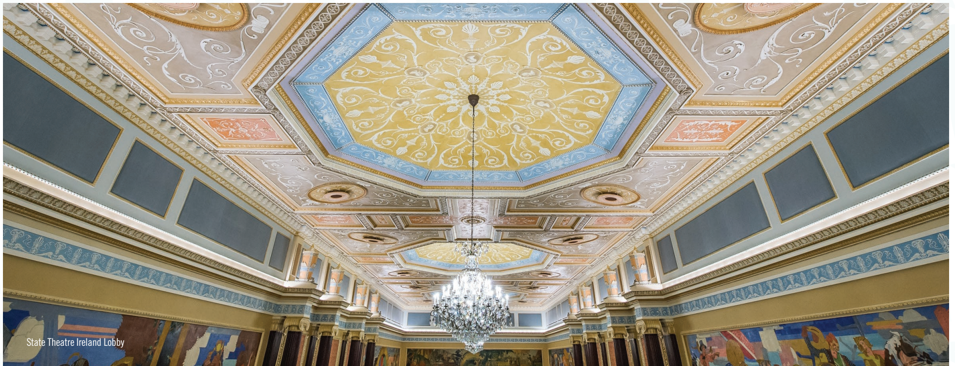
State Theatre Ireland Lobby

Free public tours depart every 15 minutes from the State Theatre Lobby from 10 a.m. to 11:30 a.m., usually on the first Saturday of each month. Tours last approximately 90 minutes and include lobbies, theater auditoriums and backstage areas. Restrictions can apply and some areas may be prohibited. Remaining 2016 tour dates: May 14, June 4, July 9, August 6, September 10, October 1, November 5 and December 3.