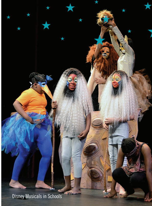
Disney Musicals in Schools

Would you like to introduce your students to the art of dance for FREE? Each September, the Community Engagement & Education Department presents Dance Showcase. This annual performance showcases Northeast Ohio's finest dance companies and national guest artists in a vast array of dance styles including tap, ballet, contemporary, modern and cultural dance.