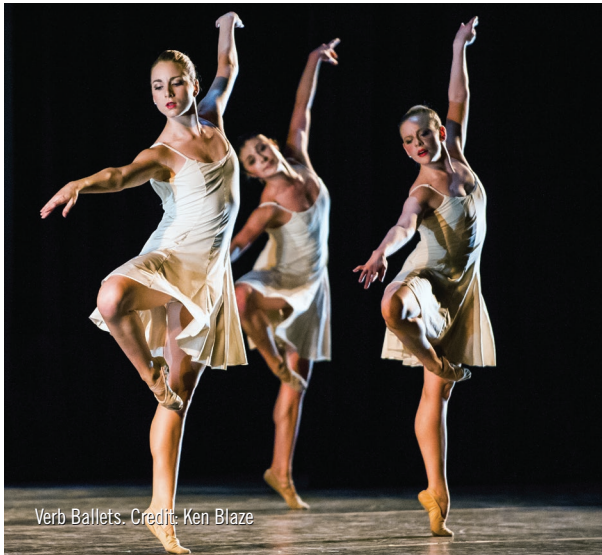
Verb Ballets.