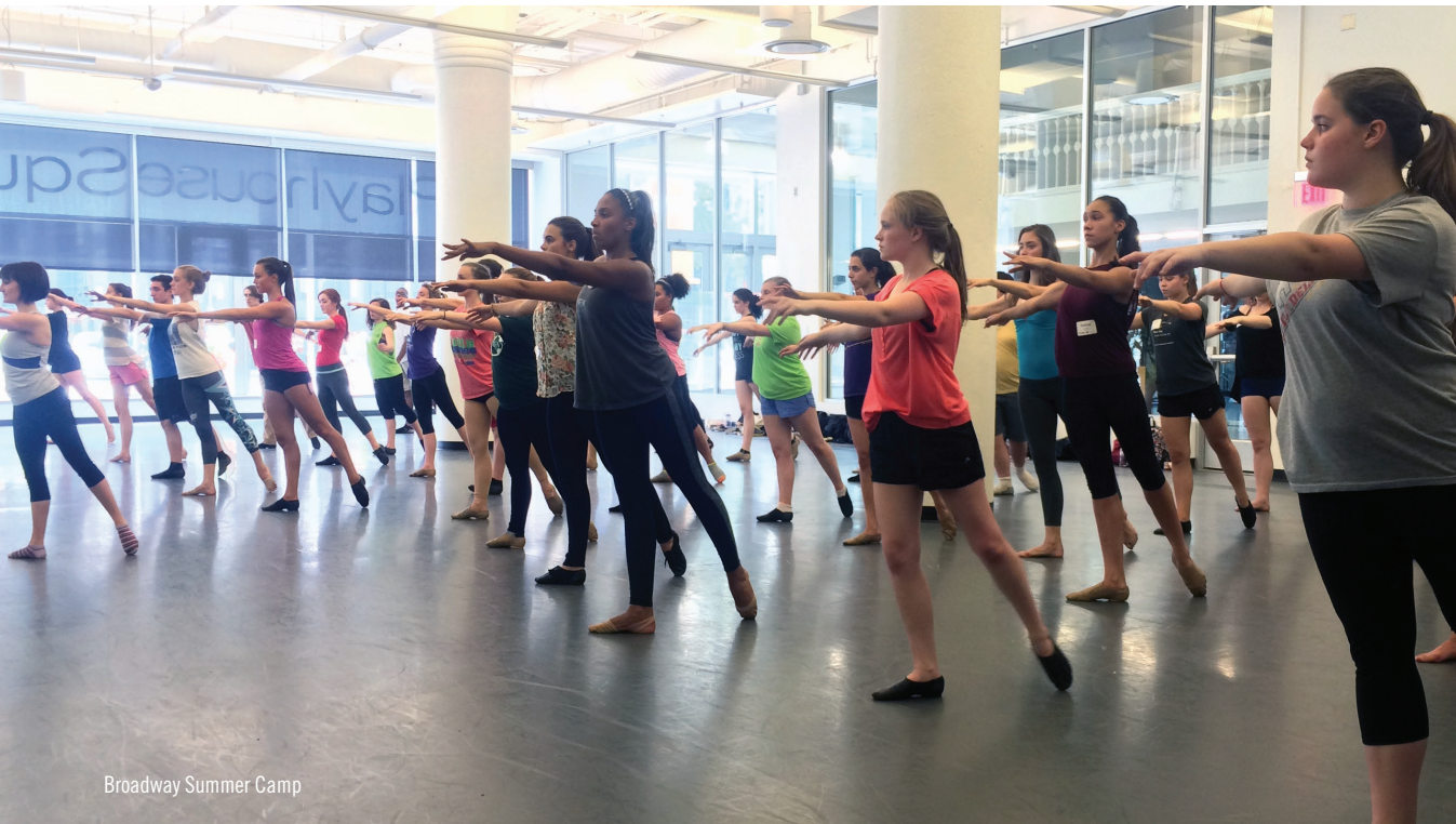
Broadway Summer Camp