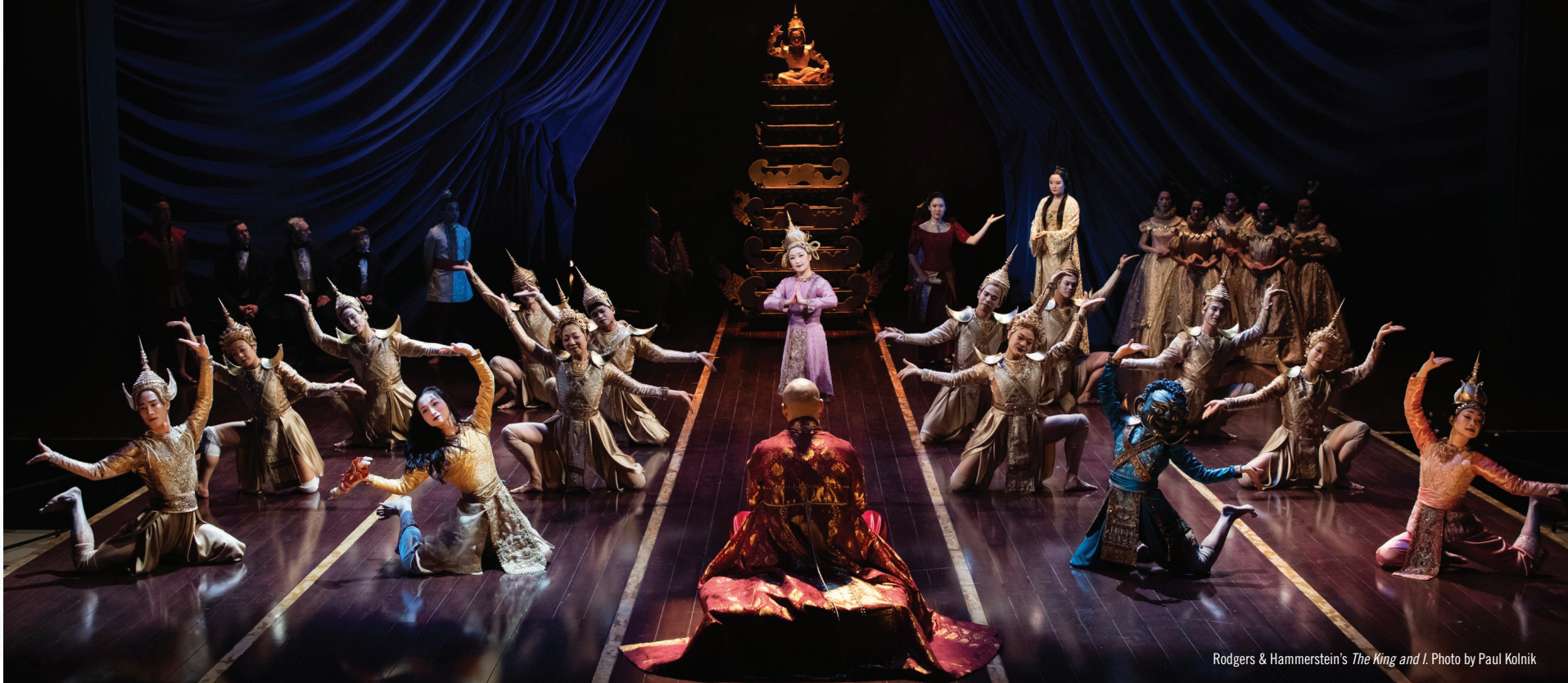
Rodgers & Hammerstein's The King and I .