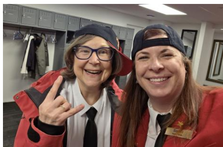
The Volunteer Room