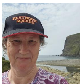
Coast of Cornwall