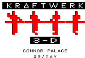
Kraftwerk Connor Palace Theatre || 90 min.