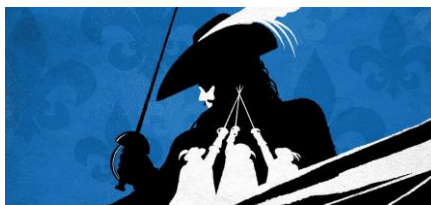
The Three Musketeers Allen Theatre || 135 min w/ I April 30 – May 22