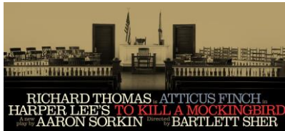
To Kill a Mockingbird Connor Palace Theatre || 235 min w/ I April 26 – May 15