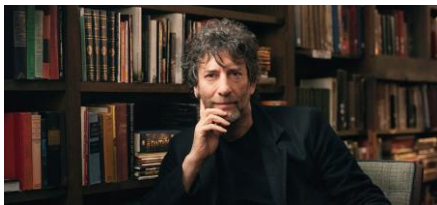
An Evening with Neil Gaiman KeyBank State Theatre || 90 min + Q&A