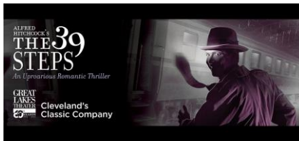
Alfred Hitchcock's The 39 Steps Hanna Theatre || 105 min w/ I April 29 – May 22