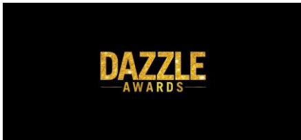
Dazzle Awards KeyBank State Theatre