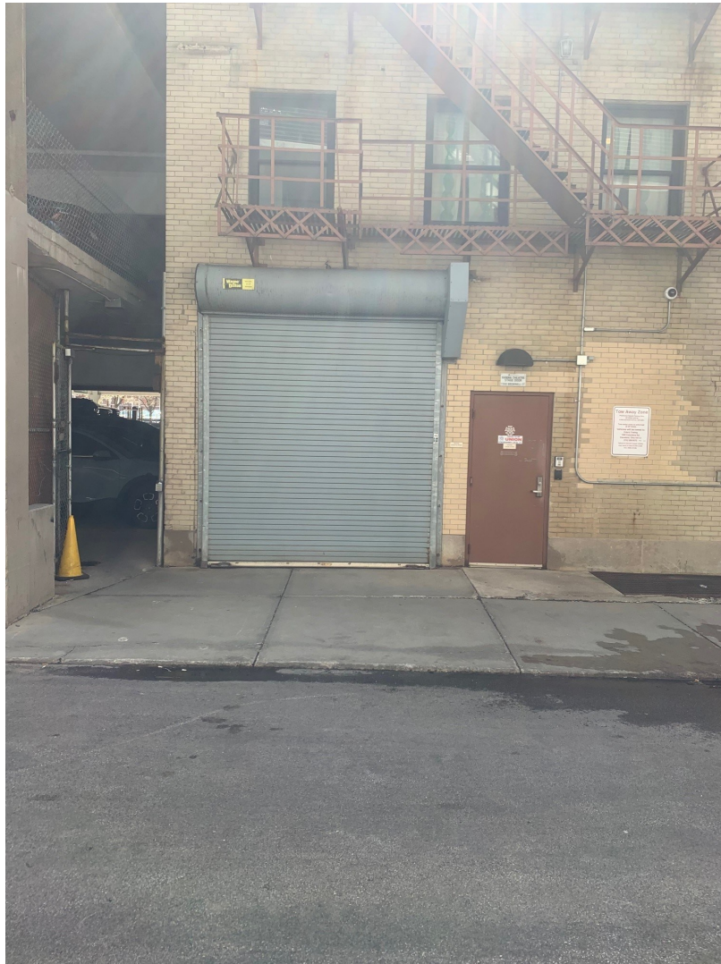
Loading Dock Photo