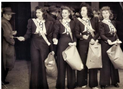
Palace Theatre Ushers – 1945