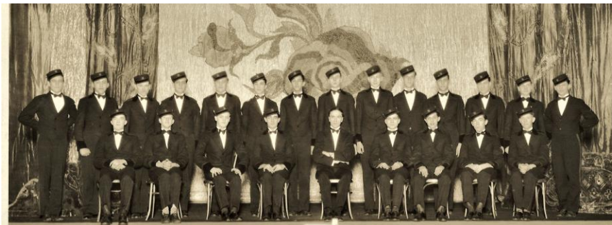
Allen Theatre Ushers - circa 1920-1930